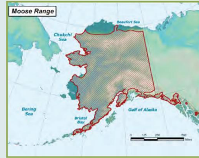
About 175,000 to 200,000 moose are widely distributed throughout Alaska.

Some areas of the state have lots of moose; other areas have few or none. The number of moose living in a certain area depends on habitat quality, weather and predation by other animals such as wolves and bears. Fire and other disturbances are important for moose in many areas of the state because fire can create new vegetative growth for moose to feed upon for many years.